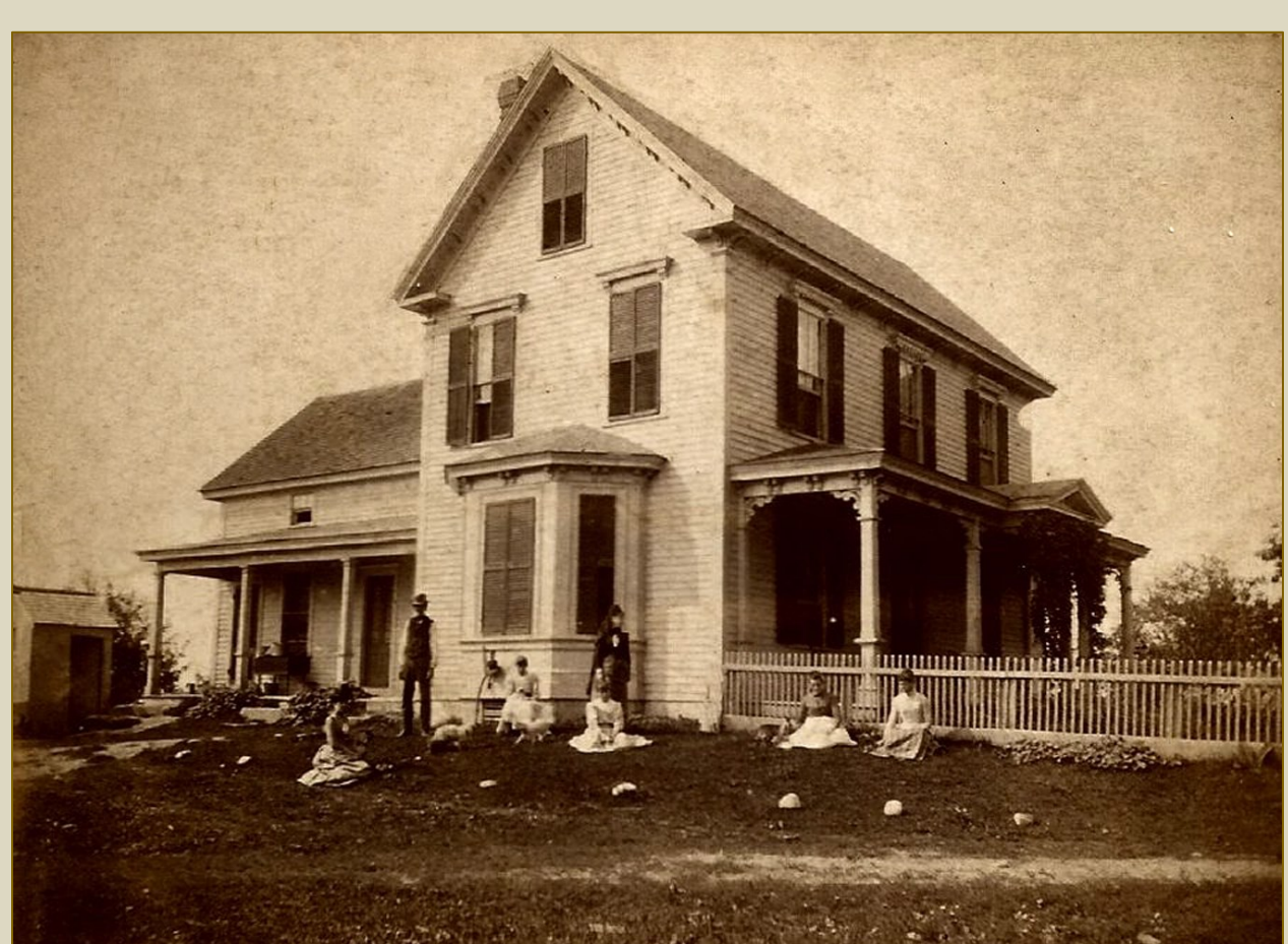
The Levi Lincoln Flagg Family Homestead Built about 1779 by Benjamin Keyes who operated it as the Keyes Tavern after fire had destroyed the original Keyes Tavern at this location in 1777

After the fire in 1777, Benjamin Keyes rebuilt the burned-out dwelling and re-opened the Keyes Tavern. The Sessions Court Records confirm that for the years 1781 and 1782, Benjamin Keyes was granted a Taverner's License.